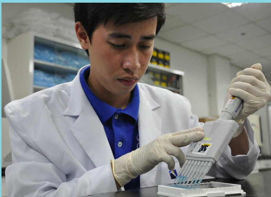
The researcher preparing materials for the PCR.