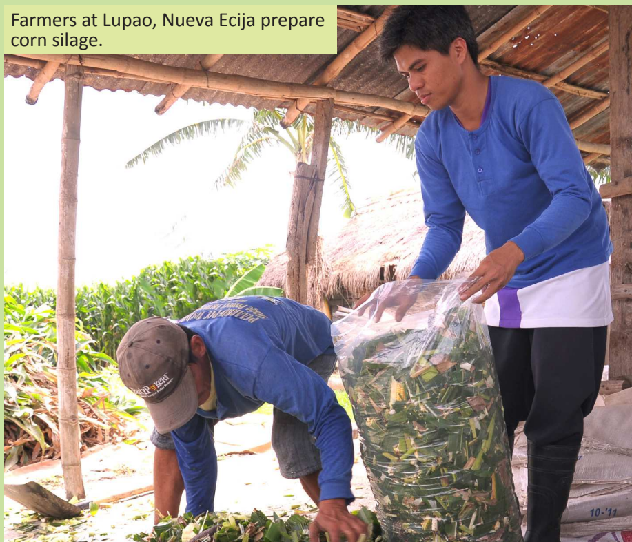
Farmers at Lupao, Nueva Ecija prepare corn silage.

cooperatives in Llanera and General Natividad, Nueva Ecija were trained for UTRS production and feeding. They were able to produce 73 tons of UTRS from the collected 200 tons of rice straws.