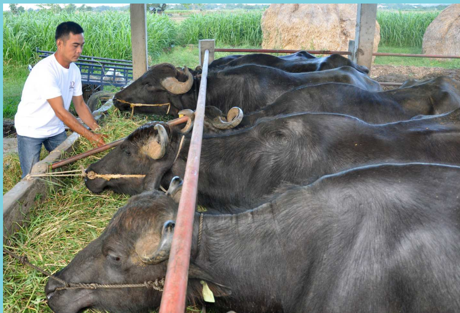
A dairy farmer in San Jose, Nueva Ecija feeds his purebred buffaloes with grasses.

Through its Dairy Herd Improvement Program (DHIP), the Philippine Carabao Center (PCC) is helping much its dairy farmer-partners and dairy cooperatives in Nueva Ecija in strengthening their animal husbandry practices as it also helps improve and increase their dairy herd.