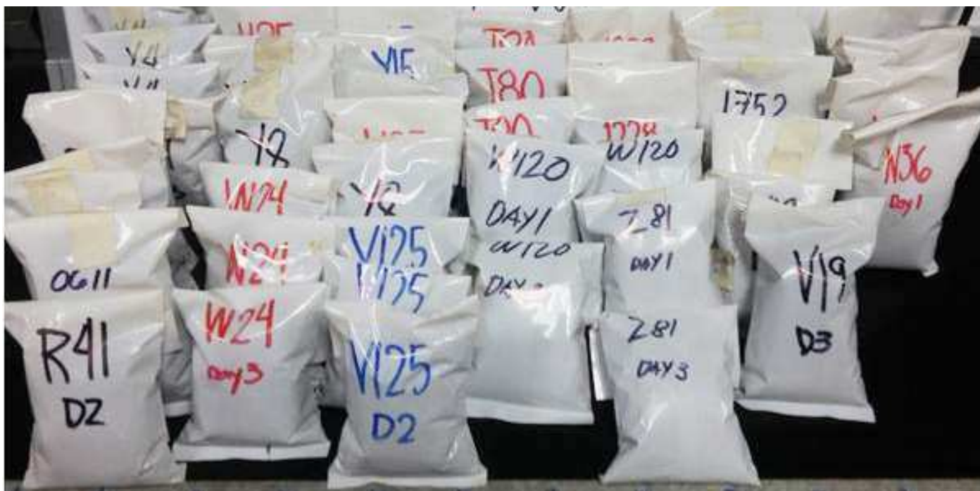
Corn distillers dried grains with soluble (DDGS) are packed for the specific treatments.

D airy carabaos' milk can be increased by feeding them with corn distillers dried grains added with solubles (DDGS), a study by PCC showed.