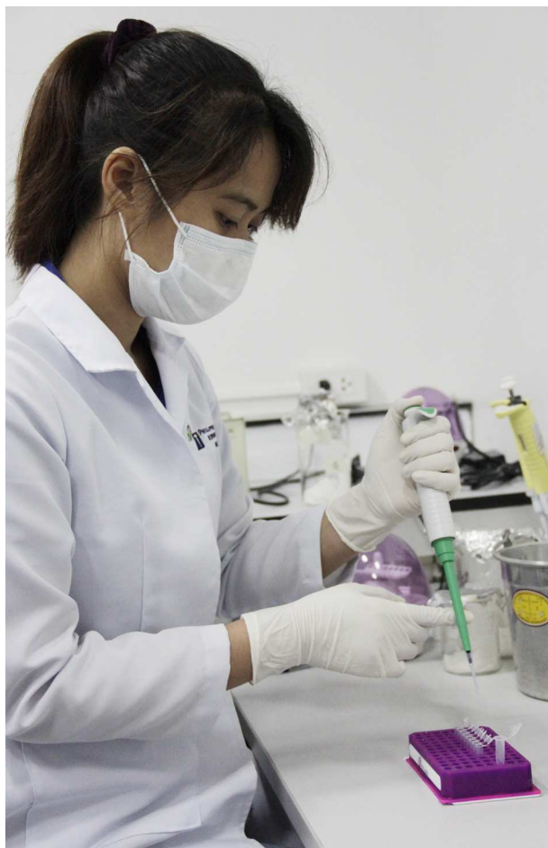
The researcher prepares reagent to be used in amplifying the PLCZeta gene of Swamp and Riverine types of water buffalo.