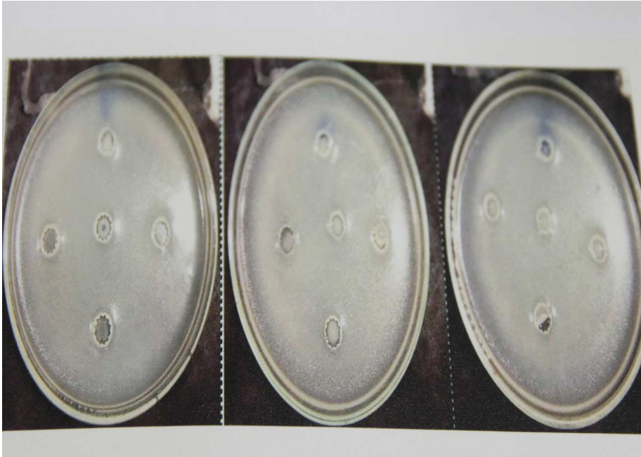
Antibiotic sensitivity test result of Acinetobacter schindleri .

A ntibiotic resistance, caused by the repeated use of it, may lead to difficulty of treatment in certain livestock diseases. This poses economic losses in the industry.