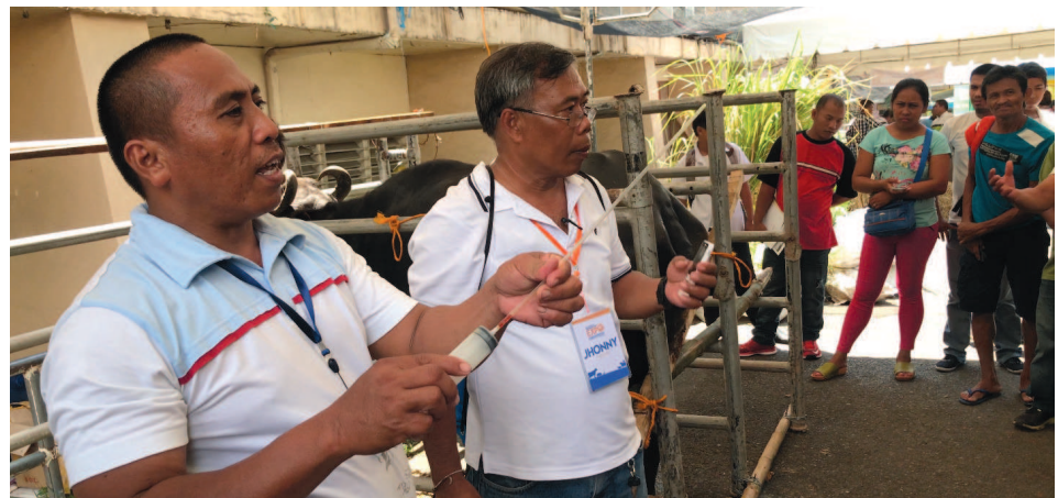
(Upper photo) Participants in the 1st Livestock Technology Expo witness actual demonstration of silage production. (Lower photo) Experts from PCC at Ubay Stock Farm show the materials for uterine flushing technology of PCC.