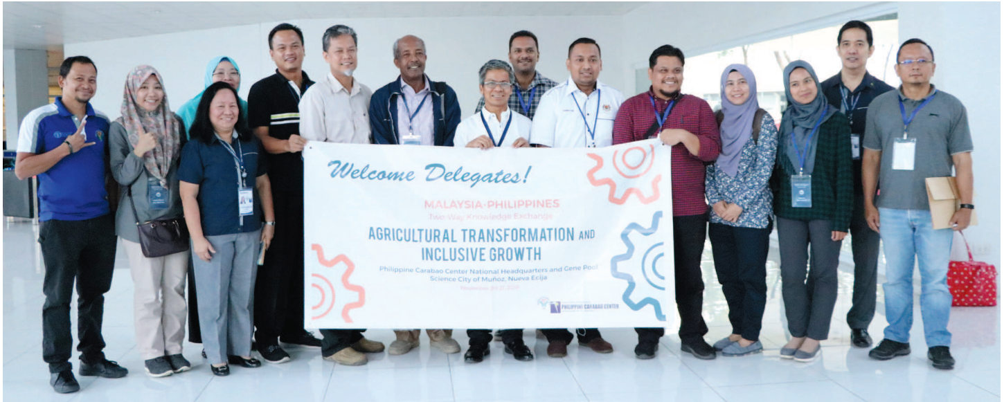
Malaysian delegates with some of the officials of the Philippine Carabao Center (PCC) during their visit at PCC last November 21.