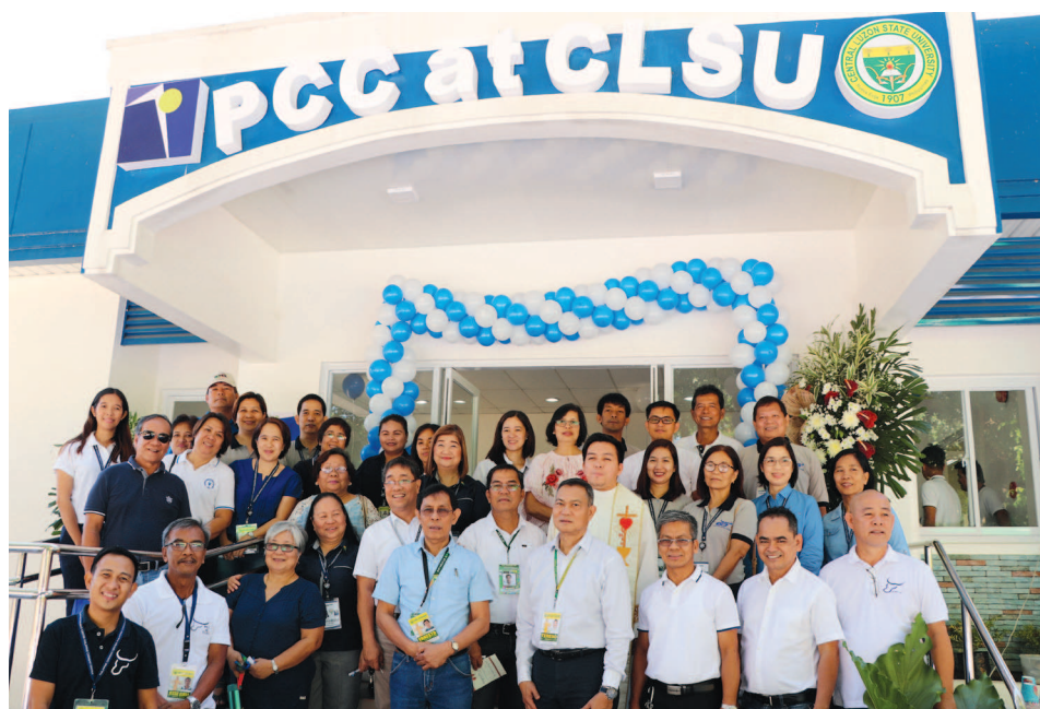
The attendees composed of the top officials of the PCC and CLSU; and PCC at CLSU staff during the inauguration of the new facility.

Another milestone was set as PCC at Central Luzon State University (CLSU) launched its new administration office at CLSU compound, Science City of Muñoz (SCM), Nueva Ecija last November 8.