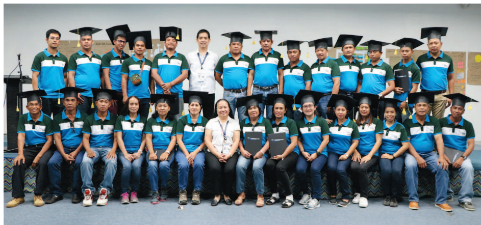
Participants from Visayas and Mindanao during their Farmers' Livestock School Facilitators' Learning Workshop Graduation at the Philippine Carabao Center. They are expected to facilitate a 34-week long FLS-DBP in their respective localities.

The Farmer Livestock School on Dairy Buffalo Production (FLS-DBP) is one of the interventions that was launched in the project sites specifically in Polanco, Zamboanga del Norte with 40 participants; Ipil, Zamboanga Sibugay, 25 participants; and Don Carlos, Bukidnon, 28 participants.