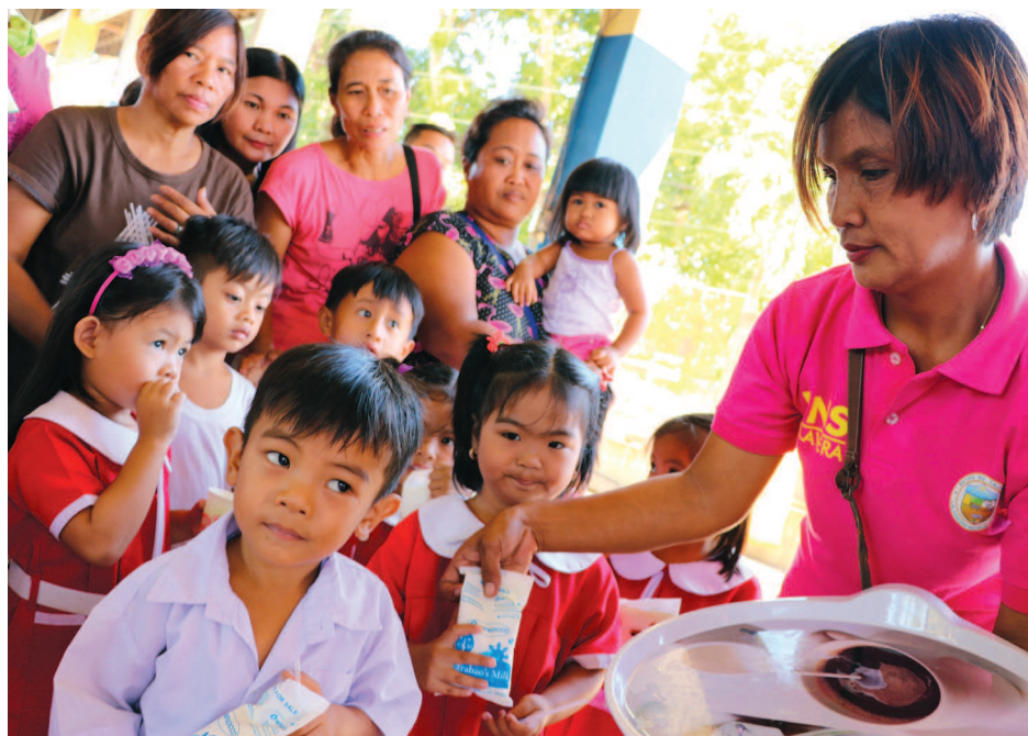
The distribution of 200ml pasteurized fresh milk during the launching of milk feeding program at Brgy. Pinagpanaan gymnasium, Talavera, Nueva Ecija last November 14.