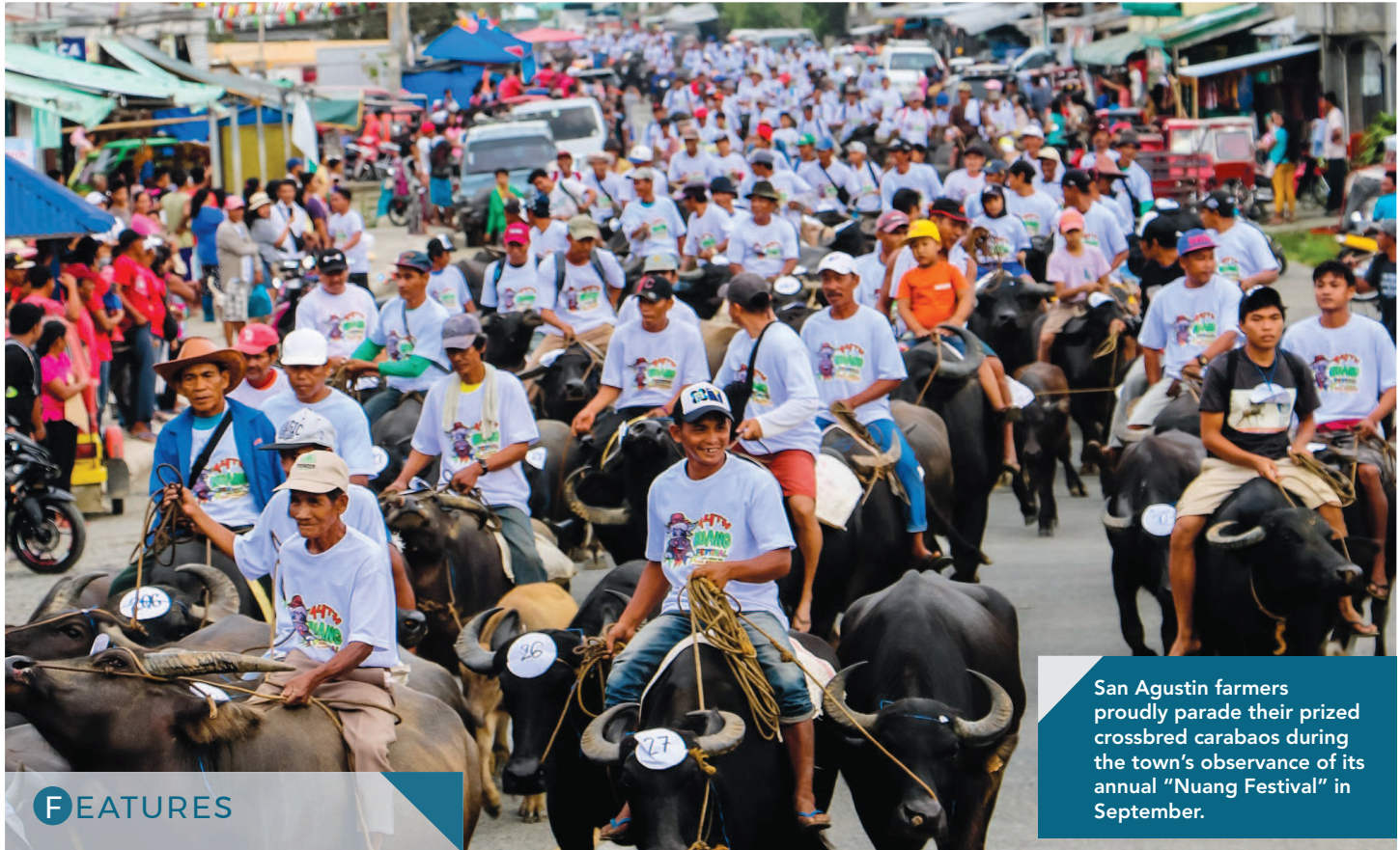
San Agustin farmers proudly parade their prized crossbred carabaos during the town's observance of its annual "Nuang Festival" in September.