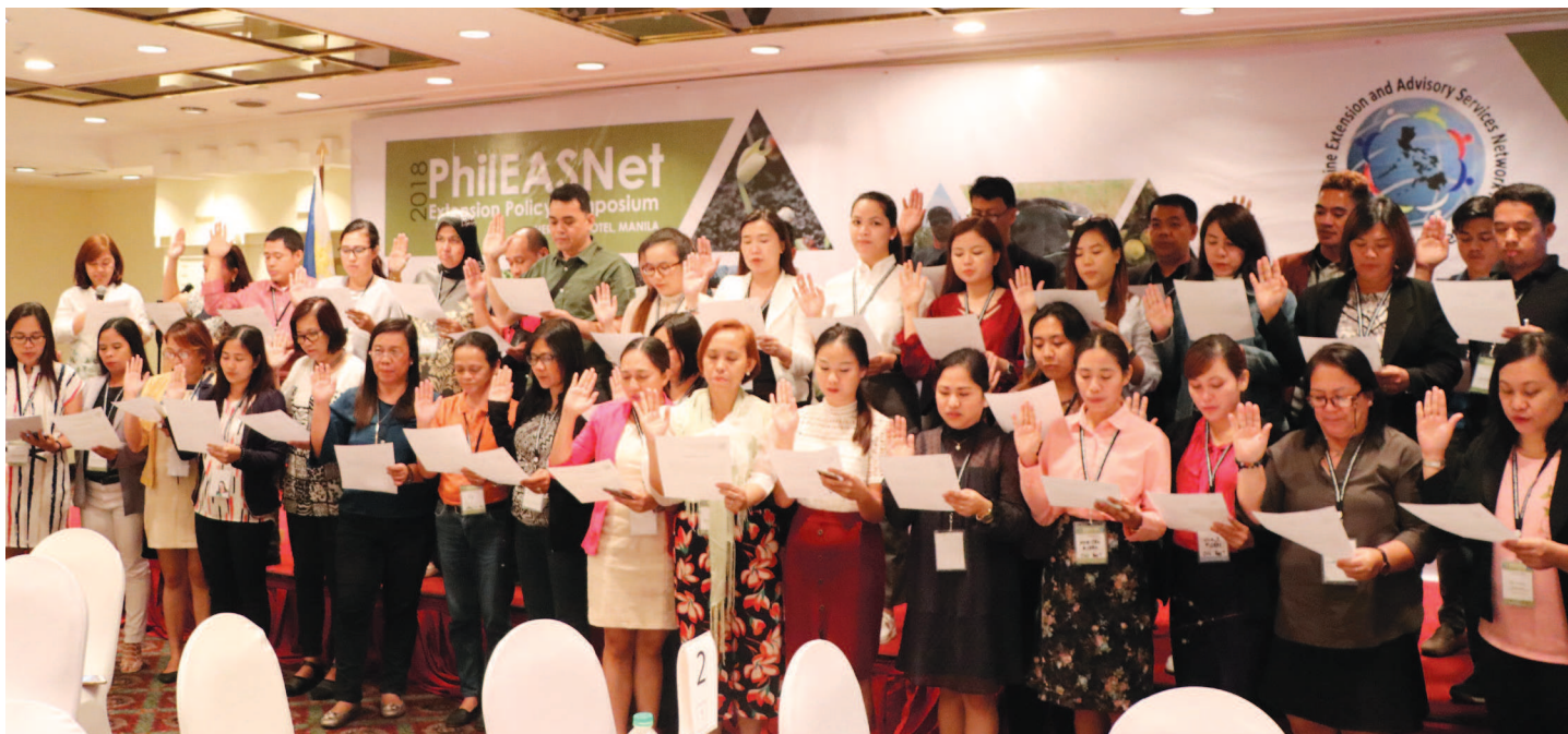
The new members of PhilEASNet, which include the staff from PCC's Knowledge Management Division, taking their oath at The Heritage Hotel Manila in Pasay City last October 4.