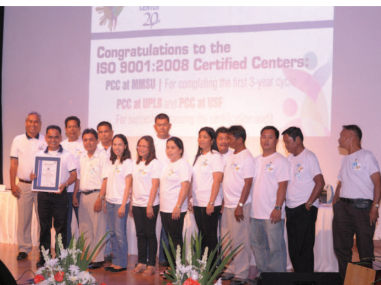
PCC at UPLB (top) and PCC at USF (bottom) receive their QMS certification from TUV SUD PSB Philippines