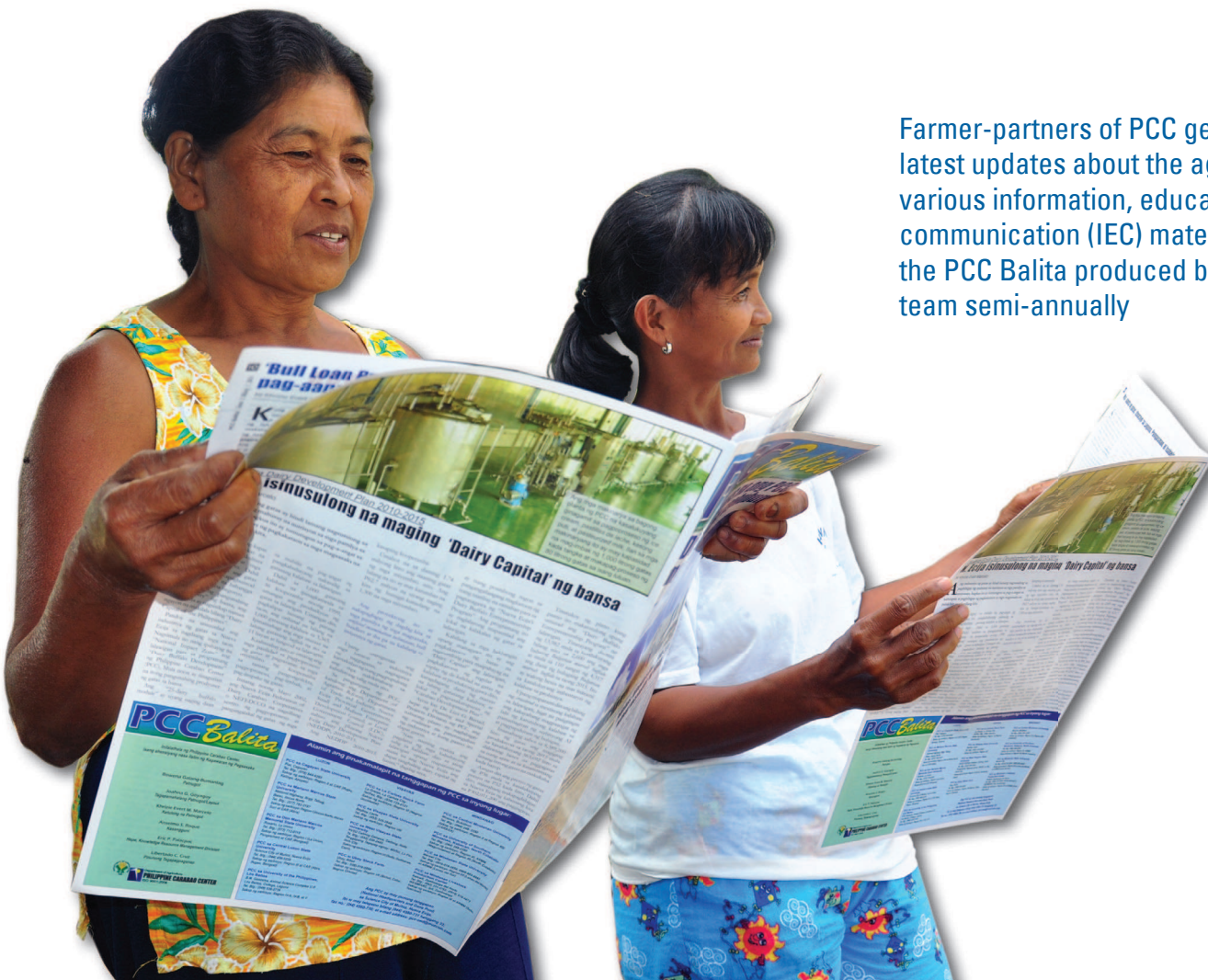
Farmer-partners of PCC get the latest updates about the agency thru various information, education, and communication (IEC) materials such as the PCC Balita produced by the ACS team semi-annually