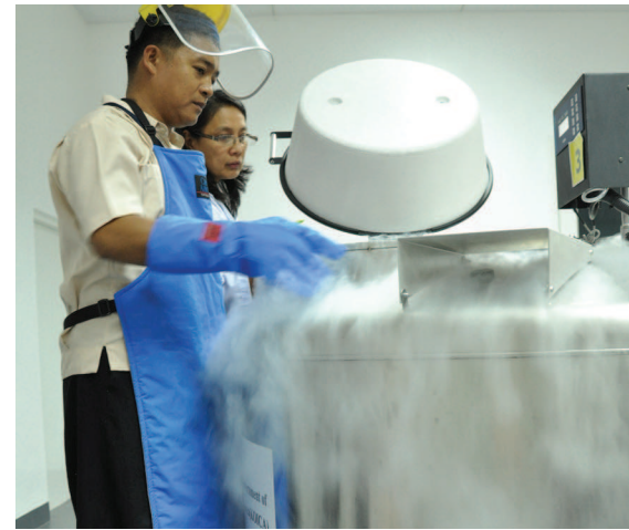
Cryobanking is PCC's proactive approach to protect animal genetic diversity for food and agriculture

Bull Loan Program. Complementing the AI service especially in areas where it is not readily accessible is the natural mating of buffaloes via the Bull Loan Program. In 2012, an additional 152 breeding bulls were loaned out for the purpose. This brings to a total of 918 purebred breeding bulls currently in the care of farmer-bull handlers all over the country.