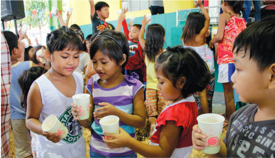
The participation of schoolchildren in San Jose City highlighted the symbolic “Tagay-Pugay” (milk toast and drinking) ceremony during the 10 th Gatas ng Kalabaw Festival sponsored by the city government which coincided with the city’s foundation anniversary. The ceremony underscored the significance of multi-sectoral efforts in the increased impacts of the Carabao Development Program in the local dairy industry in Nueva Ecija.