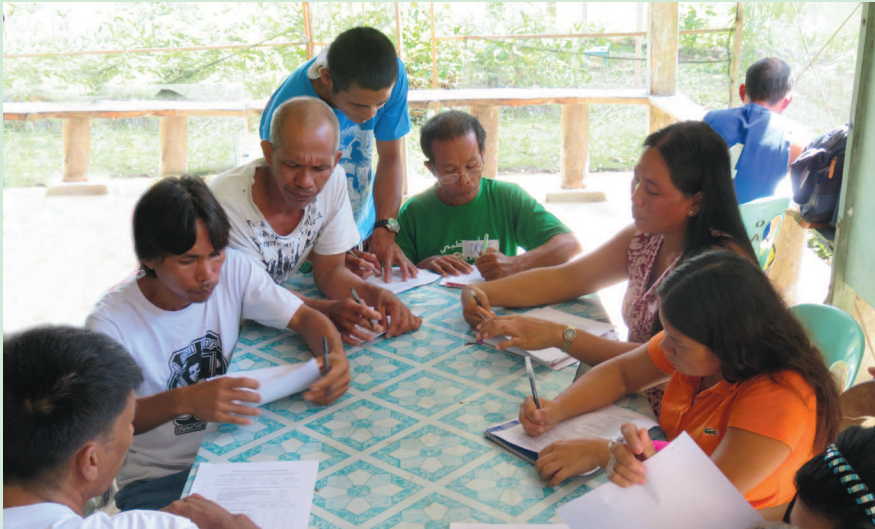
Dairy farmers in Sultan Kudarat went through various group activities during the social preparation training. The training included assessment of their readiness and commitment to the Carabao-Based Enterprise Development (CBED) program.

community organizer, all PCC-USM frontline development officers, served as the resource speakers.