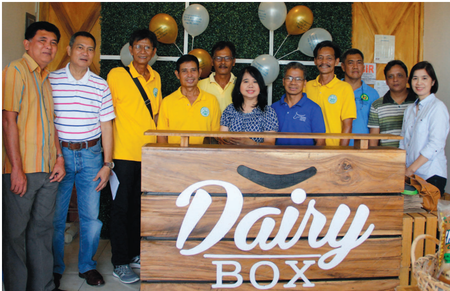
Some of the key officials and members of the Philippine Carabao Center (PCC), Department of Trade and Industry (DTI), Central Luzon State University (CLSU) and Catalanacan Multi-Purpose Cooperative (CAMPC) during the grand opening of Dairy Box in Cabanatuan City last August 20. Dairybox was established by the PCC to serve as a venue where dairy farmers could sell and showcase their products in a wider market for greater income. CAMPC hosts the said store.

"Opening a new branch in the heart of Cabanatuan City marked a new milestone in our organization. It's a positive step