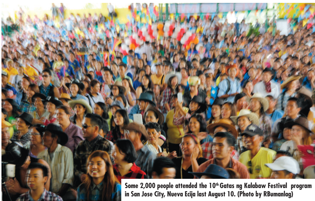
Some 2,000 people attended the 10 th Gatas ng Kalabaw Festival program in San Jose City, Nueva Ecija last August 10.

The 10 th edition of Nueva Ecija's annual "Gatas ng Kalabaw (Carabao's Milk) Festival" was showcased anew last August 10 as the province continues to prove its unofficial claim as the "Dairy Carabao Capital of the Philippines".