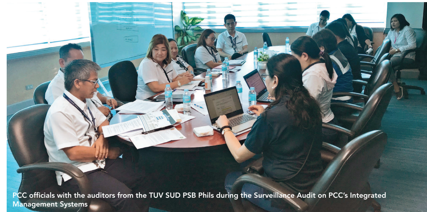
PCC officials with the auditors from the TUV SUD PSB Phils during the Surveillance Audit on PCC's Integrated Management Systems