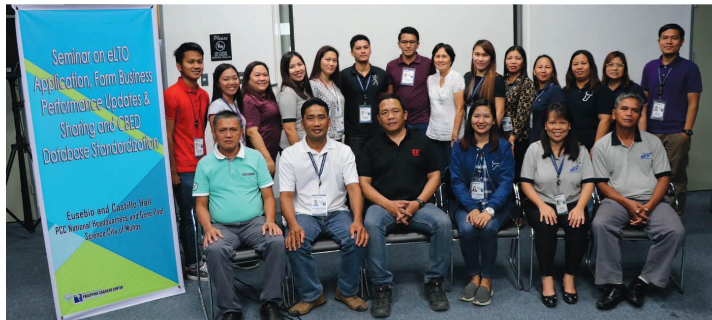
Some of the PCC's frontliners across its network who participated in the orientation and workshop on Electronic License to Operate (eLTO) Application, Farm Business Performance Updates and Sharing and CBED Database Standardization.

The activity output was very promising: Bantog Samahang Nasyon Multi-Purpose Cooperative was able to prepare the required documents for application; Lamac Multi-Purpose Cooperative was able to upload the required documents; Eastern Primary Multi-Purpose Cooperative, Rosario Dairy Cooperative, Magdalena Agriculture Cooperative and Mindoro Dairy Cooperative had already requested for their user account; Mapiña Farmer Irrigators Association and Leon Confed Farmers Cooperative was in the process of preparing their documents; Catalanacan Multi-Purpose Cooperative was advised to follow-up the results of their first audit with FDA; San Agustin Dairy Cooperative was in the process of preparing for the final inspection; and the Cebu Technological University was in the process of preparing the required documents and in requesting for their user account. Once these organized farmers' groups have secured their license from FDA, the NDA can accredit them as suppliers of milk for the Milk Feeding Program.