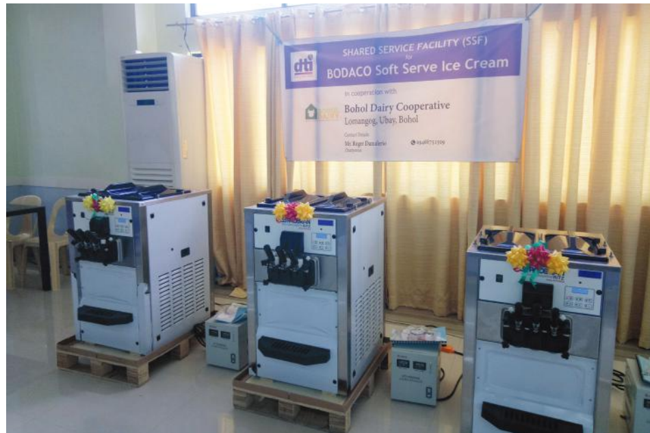
BODACO receives three units of soft ice cream machines from the DTI's SSF project.

The Department of Trade and Industry (DTI) thru its Shared Service Facility (SSF) project awarded three units of Soft Ice Cream Machines to Bohol Dairy Cooperative (BODACO) during the launching activity on March 22 at Philippine Carabao Center at Ubay Stock Farm (PCC at USF), Lomangog, Ubay, Bohol.