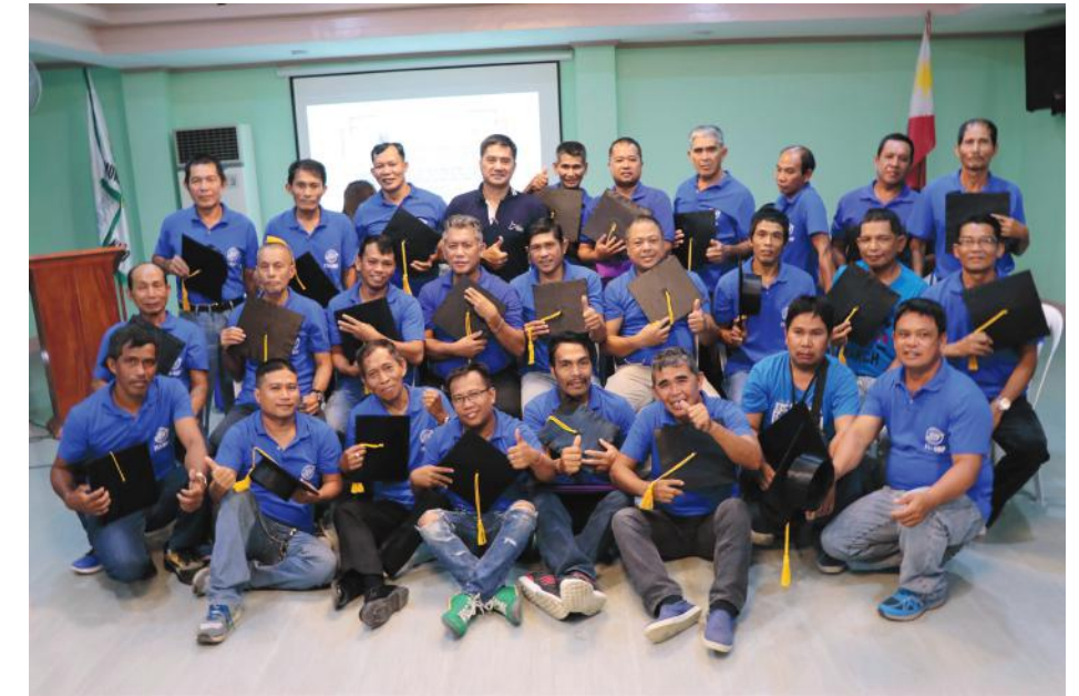
The farmer-graduates of FLS-DBP in Sto. Niño, South Cotabato.

"The PCC at University of Southern Mindanao (PCC@USM) is committed to engage in different means of