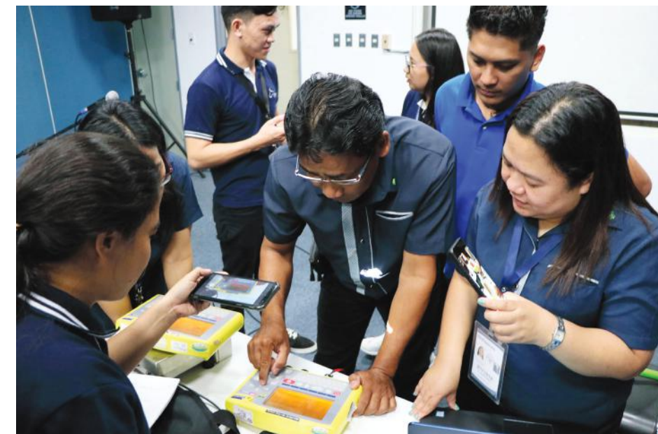
Hands-on practice of the participants on the use of digital animal weighing scale and RFID reader.