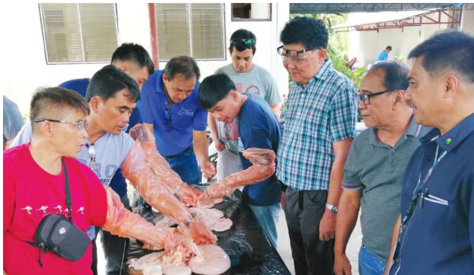
Some of the participants while familiarizing themselves with female carabao's reproductive organs.

Twelve successful participants composed of provincial artificial insemination coordinators (PAIC) who are also performing as AI technicians from Davao del Sur, Davao Oriental, Davao del Norte, Compostela Valley, North Cotabato, South Cotabato, Sultan Kudarat, Sarangani and Maguindanao completed the Advance Training on Ovarian Palpation facilitated by the Philippine Carabao Center at University of Southern Mindanao (PCC at USM) from May 1 to 12, 2019.