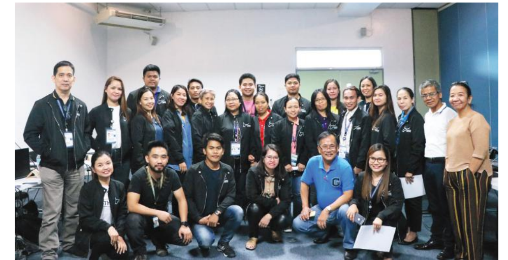
Participants, facilitators, and resource persons of the two-day training workshop for PCC Regional Information Officers (RIOs): "Strengthening Reportage of Regional CDP Highlights" held on March 28-29 at the PCC National Headquarters and Gene Pool.