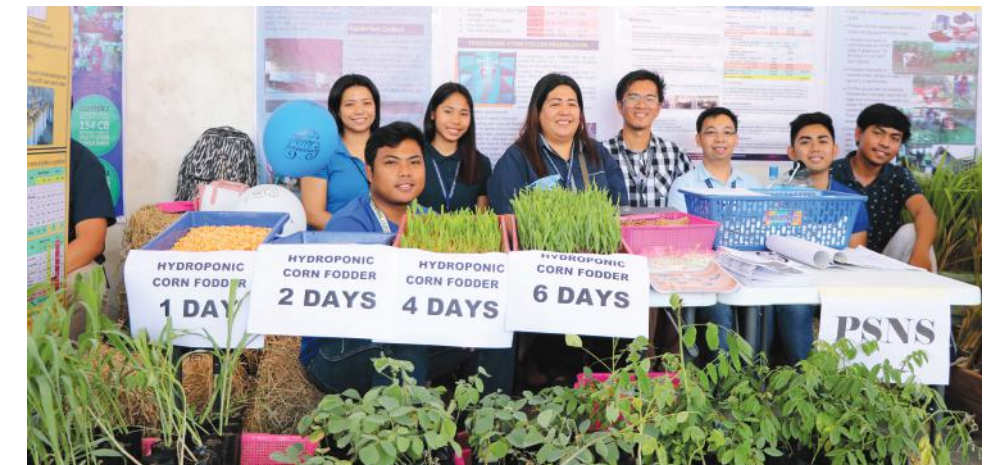
These improved forages and legumes provide good sources of nutrients for buffaloes. They are also safer compared to traditional tethering system, cheaper, and convenient for farmers, as these address feed scarcity during dry season.

which is one of the components emphasized in a collaborative R4D program “Enhancing Milk Production of Water Buffaloes through S&T Interventions” between PCC and Philippine Council for Agriculture, Aquatic and Natural Resources Research and Development (PCAARRD). This program underscored animal nutrition as an important aspect.