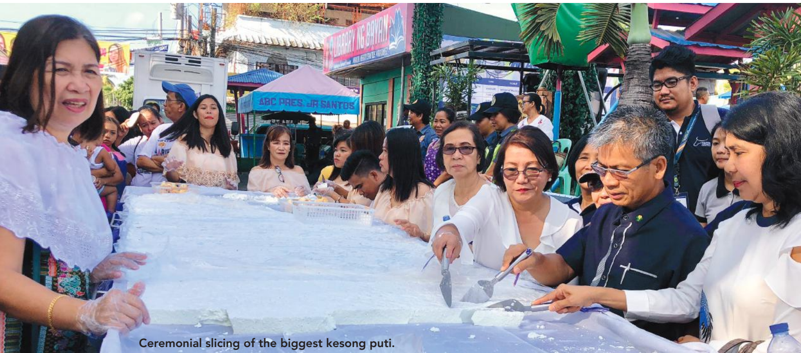
Ceremonial slicing of the biggest kesong puti.