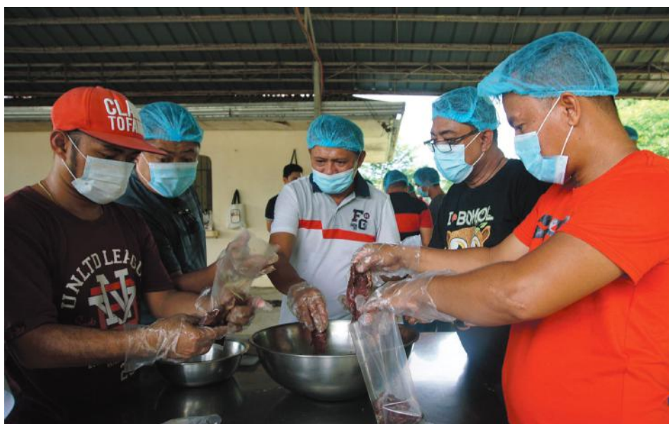
Some participants of the Farmer Livestock School on Dairy Buffalo Production (FLS-DBP) Facilitator's Learning Workshop gain hands-on training on processing buffalo meat products.