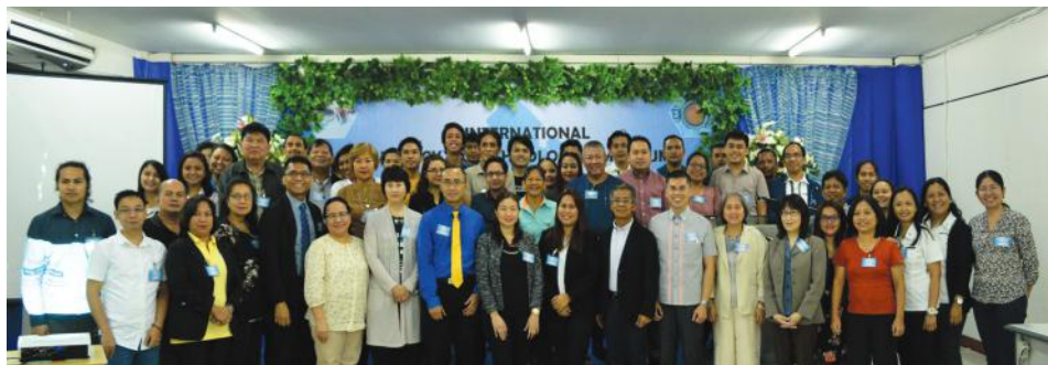
The delegates of the 4 th International Livestock Biotechnology Symposium in a group photo.

About a hundred researchers, scientists, international experts, and other distinctive guests in the field of livestock biotechnology attended the recently concluded 4 th International Livestock Biotechnology Symposium.