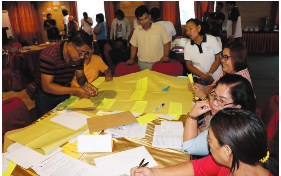
Some of the Carabao-based Business Improvement Network (CBIN) Project Stakeholders while crafting a strategic plan for the implementation of the said project.

To establish strategic direction on Carabao-based Business Improvement Network (CBIN) in propelling an inclusive, sustainable, and highly competitive local dairy industry, Philippine Carabao Center (PCC) conducted the Stage 2 Strategic Planning Workshop on CBIN last July 22-24 in Davao City.